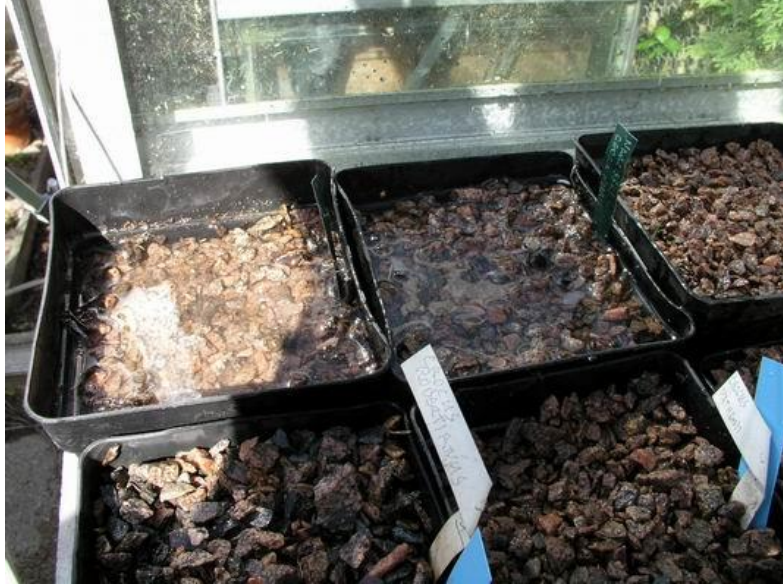
Draining plastic pots

I will go through this process three or four times until I am sure that the potting compost is watered all the way through.