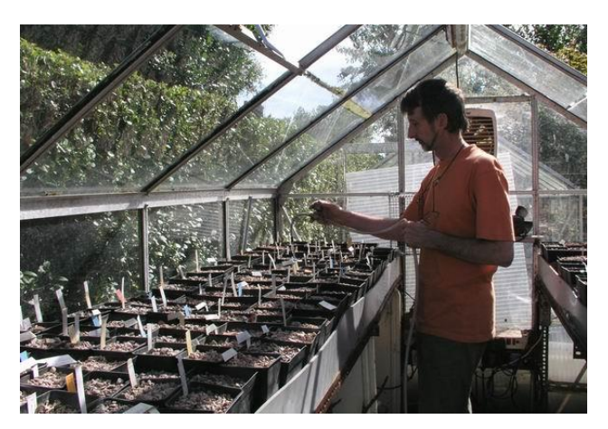
Flooding plastic pots

I use a hose pipe with a small valve that I have attached to make it easy to control the flow and direction of the watering. I go round all the plastic pots flooding each one in turn. By the time I have got to the end, the surface water on the first pots to receive the water has drained away and I repeat the process.