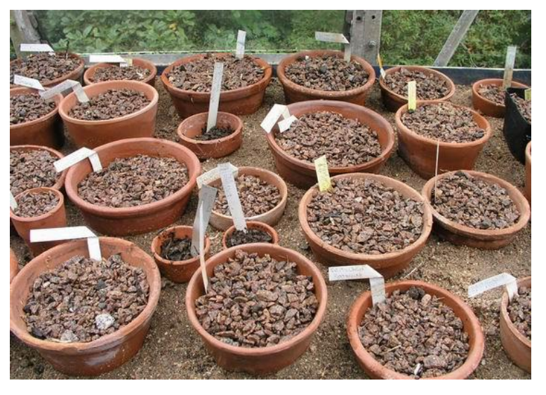
Plunged clay pots

When I flood the clay pots for the second or third time, I like to see bubbles rising, this will indicate that the water has penetrated the compost fully.