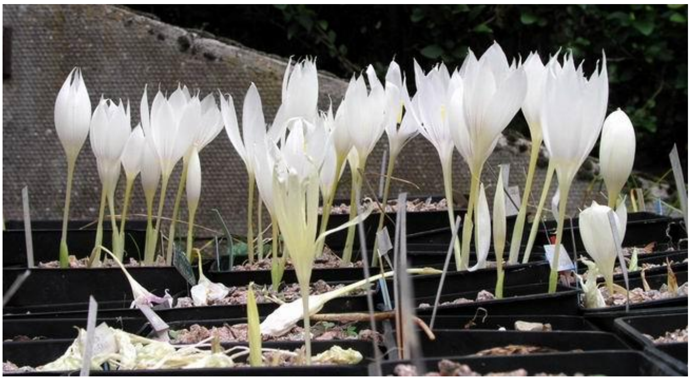
Crocus vallicola in frame

I have spoken about Crocus vallicola in recent logs but I have not shown you a picture of it in the frame where it looks great, en masse. It is amazing to see the number of hoverflies they attract, especially when the sun shines.